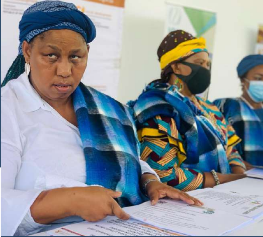
Deputy Minister Bogopane