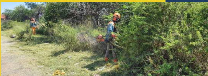
MKLM grass cutters