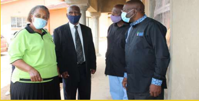
MMC for LED Cllr Nkotswe, Mayor Diale & Deputy Minister Mahlalela

The tourism industry has been severely impacted by the Covid pandemic which resulted in thousands of job losses and many establishments closing down these were the words of Deputy Minister of Tourism Hon. Amos Fish Mahlalela during his Two days visit to Pilanesburg National park. Deputy Minister visit began at Madibeng Municipality @ Hartebees tourist harbour on the 09th February and ended on the 10th February at Moses Kotane Local Municipality.