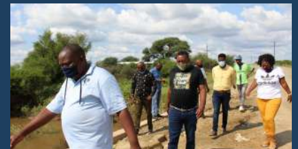
Acting Mayor Cllr Victor Kheswa, Speaker Cllr Hazel Ndlovu, MEC Molapisi, Cllr Mmolawa assessing damaged roads

Municipality Leadership has pleaded with Department of Public Works and Transport MEC to see, assess for himself and see how the provincial roads have been severely affected by recent heavy rains or floods and come up with intervention measures.