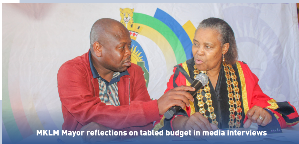
MKLM Mayor reflections on tabled budget in media interviews