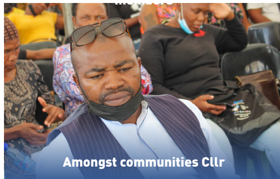
Amongst communities Cllr