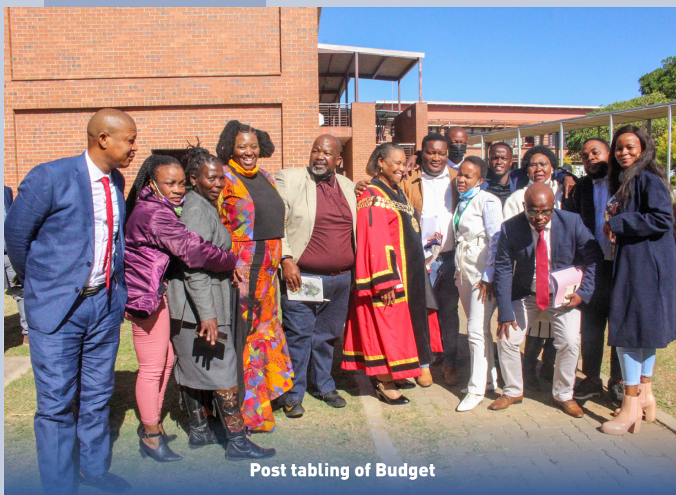
Post tabling of Budget