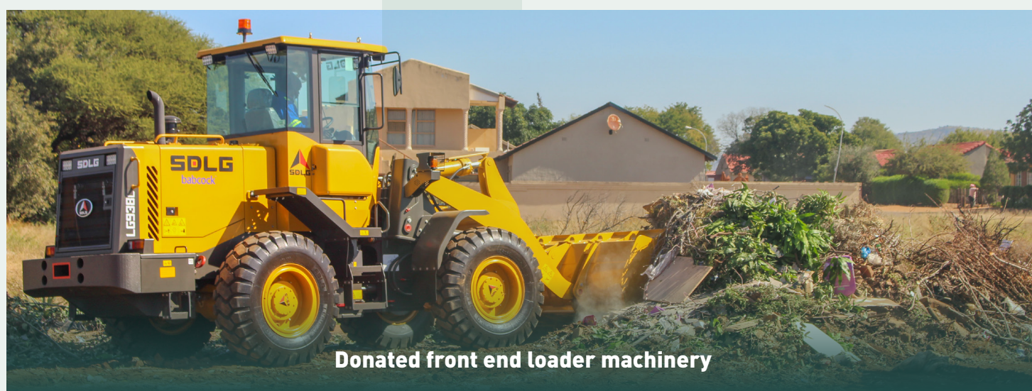
Donated front end loader machinery