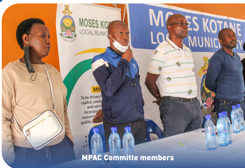
MPAC Committe members