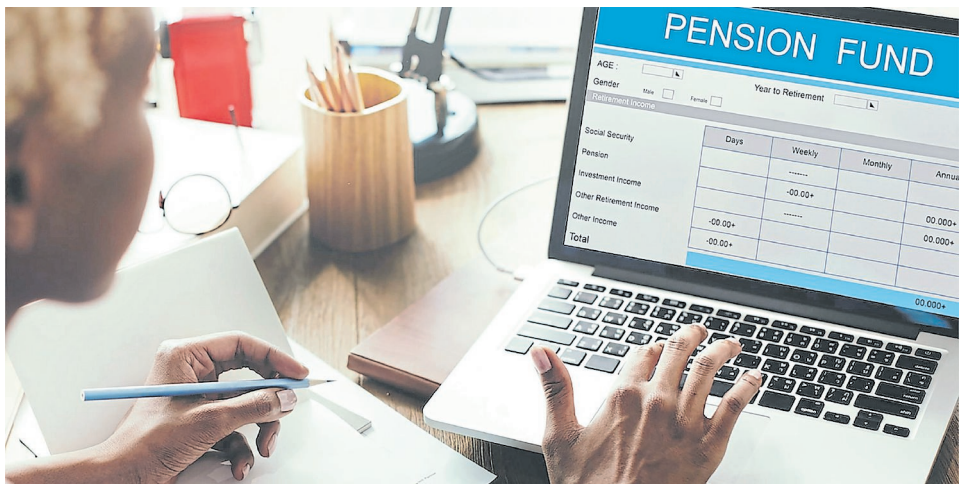
The Office of the Pension Funds Adjudicator has ordered the Metal Industries Provident Fund to pay a full death benefit after a complaint was received.