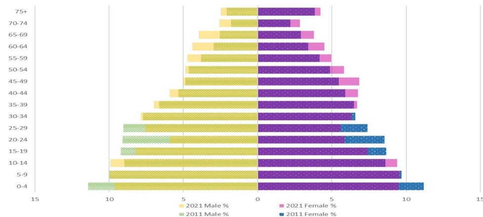
1.4.5 Figure 2: Population pyramids for comparing the 2011 and 2021 age and gender distribution