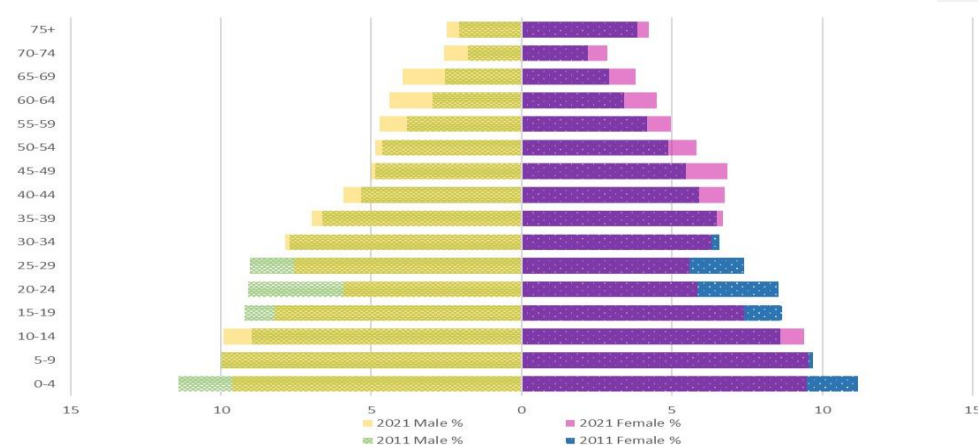
1.4.5 Figure 2: Population pyramids for comparing the 2011 and 2021 age and gender distribution