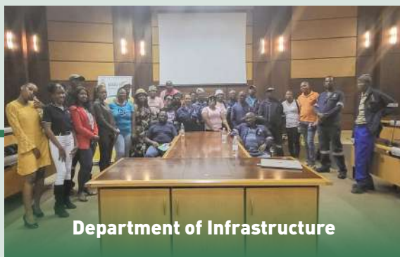
Department of Infrastructure