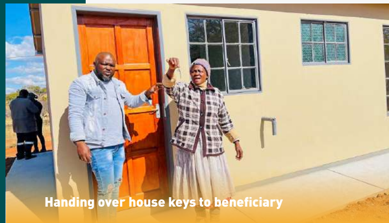
Handing over house keys to beneficiary

Pella, Tlokweng, Mopyane, Motlhabe, Kameelboom, Sesobe, Maretlwane, Masekeloane, Ngweding, Mogoditshane, Moubane, Ntswana le Metsing, Ledig, Bapong, and Pella are among the communities where the RDP project is now being implemented in the Moses Kotane Local Municipality.