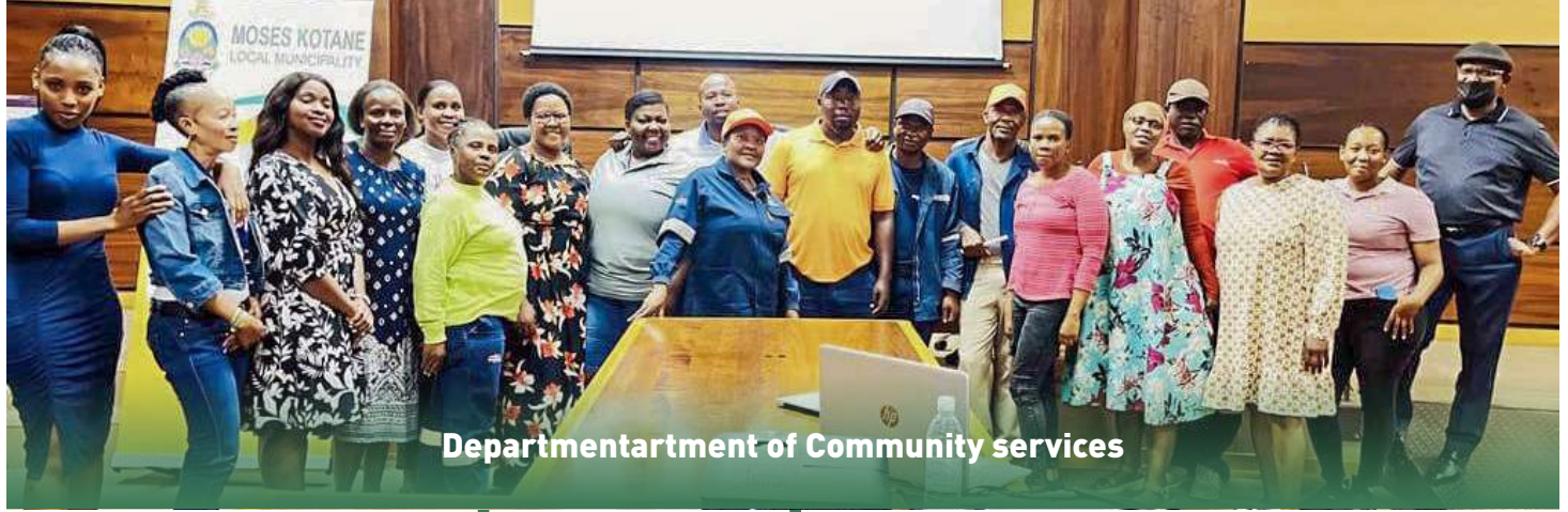
Department of Community services