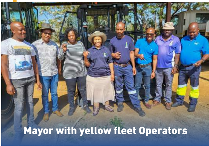
Mayor with yellow fleet Operators