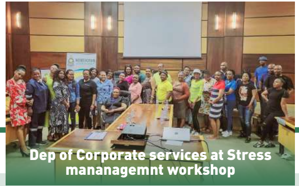
Dep of Corporate services at Stress management workshop