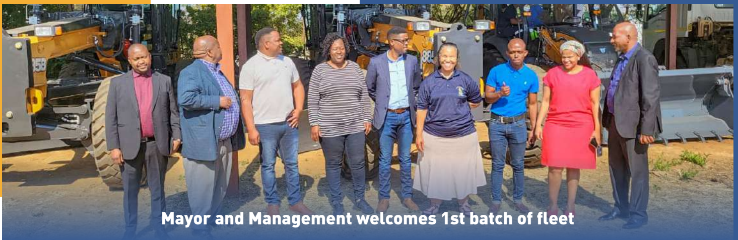
Mayor and Management welcomes 1st batch of fleet