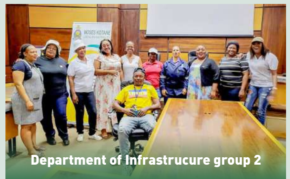
Department of Infrastructure group 2