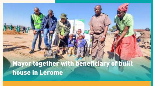
Mayor together with beneficiary of built house in Lerome