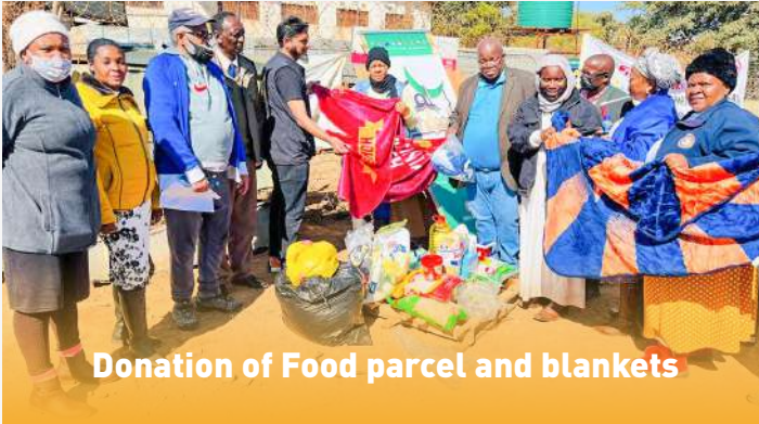
Donation of Food parcel and blankets