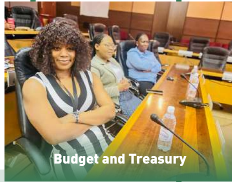
Budget and Treasury