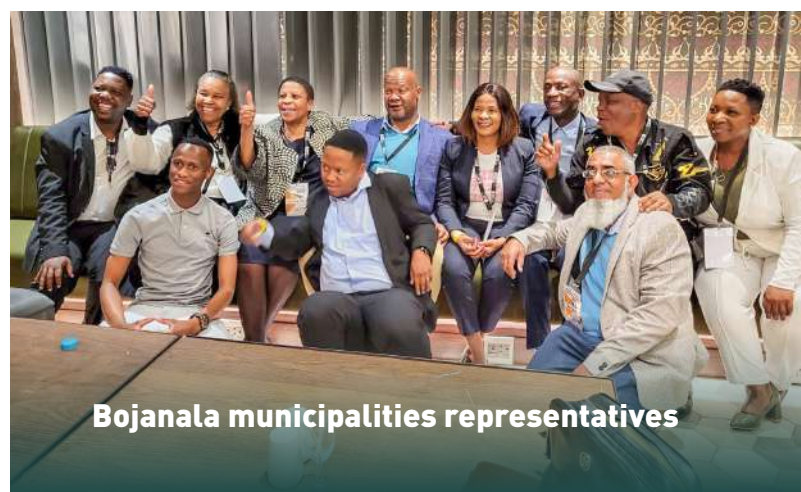
Bojanala municipalities representatives