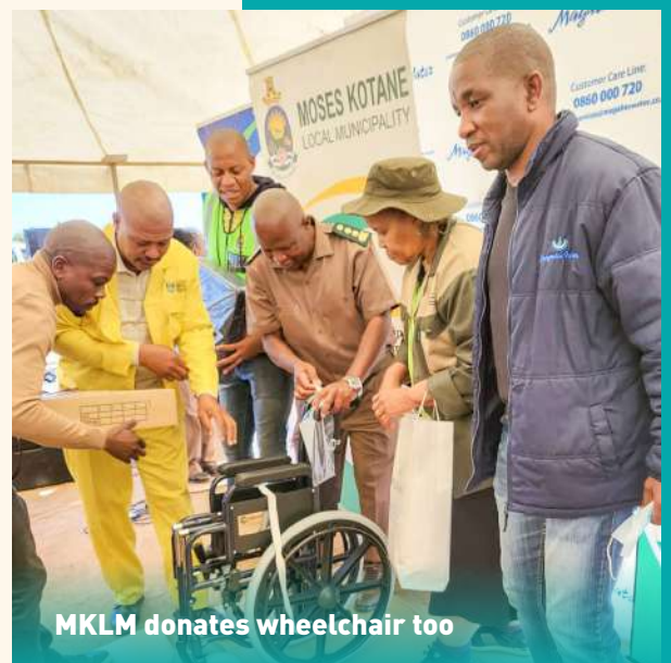
MKLM donates wheelchair too