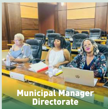
Municipal Manager Directorate