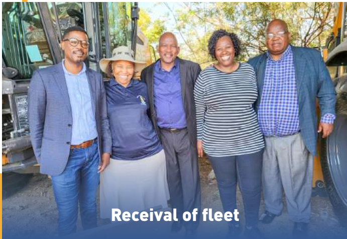
Receival of fleet