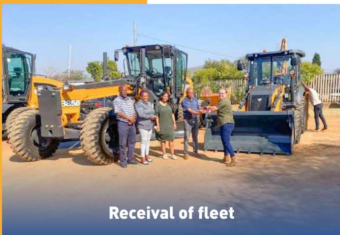
Receival of fleet