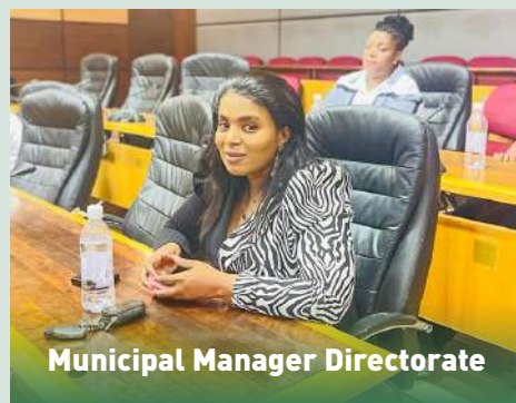
Municipal Manager Directorate