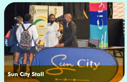
Sun City Stall