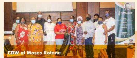
CDW of Moses Kotane

You can also call DTT Call Centre @ 0860 736 832/or whatsapp 072 196 8368