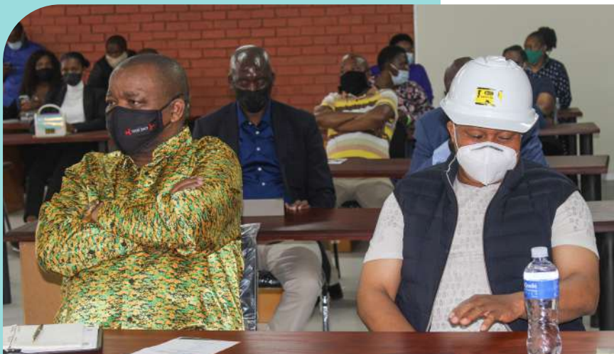
Minister Gwede Mantashe and North West Premier Bushy Maape