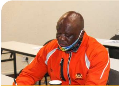
MEC Saliva Molapisi