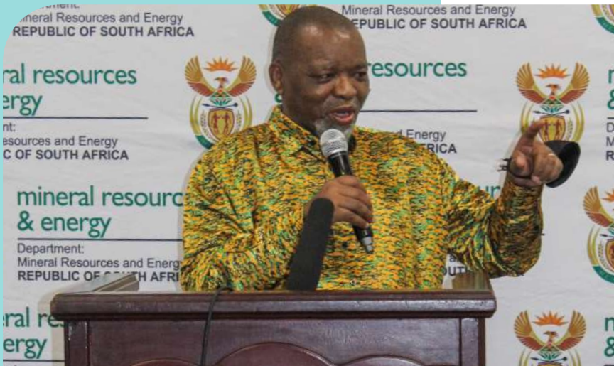
Bojalana DDM champion Minister Mantashe