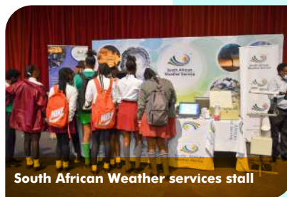
South African Weather services stall