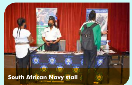
South African Navy stall