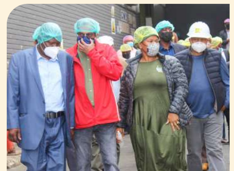
walk about at factories