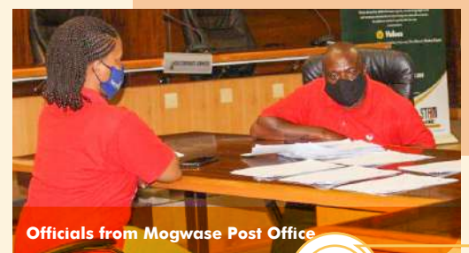
Officials from Mogwase Post Office