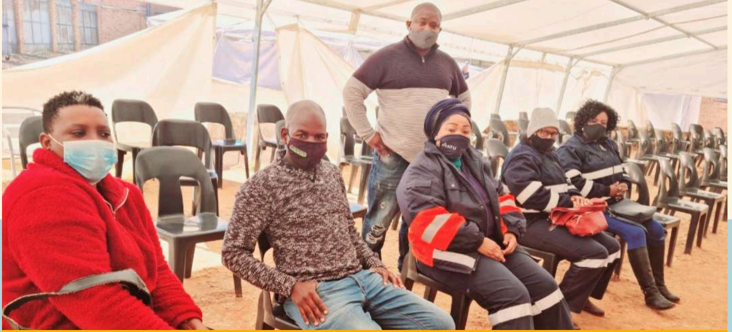
MKLM employees vaccinated on the scheduled day