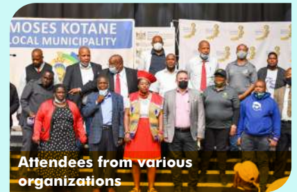
Attendees from various organizations