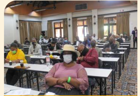
Attendees of DDM program @ Kwa-Maritane