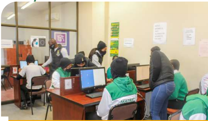
Librarians helping Learners