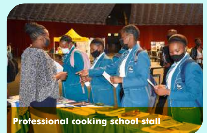
Professional cooking school stall