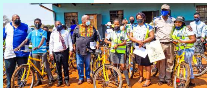
Donation of bicycles